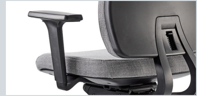
AZB Height and front/back adjustable arm with black soft feel topper and black bracket