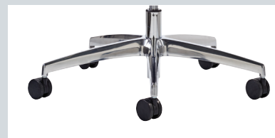
B7 Aluminium 5 Star base with black nylon castors