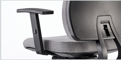
AB Black height adjustable arm with soft feel topper