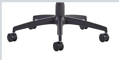
B6 Black 5 Star PA base as standard with black nylon castors