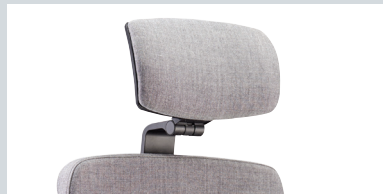
HRUP Upholstered chair fully adjustable headrest