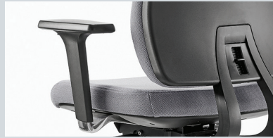
AZA Height and front/back adjustable arm with black soft feel topper and aluminium bracket