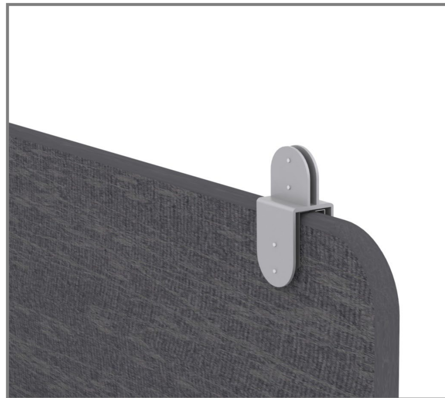
3 Place plug-on bracket over fabric protectors & evenly tighten grub screws