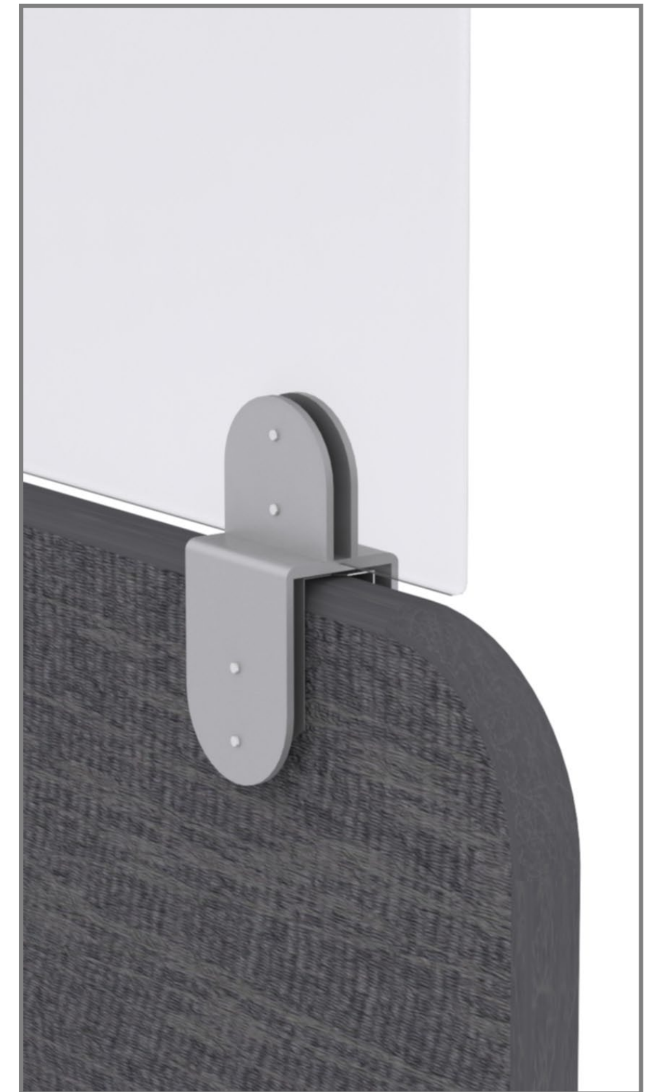
5 Carefully evenly tighten grub screws to secure glass panel, not over tightening