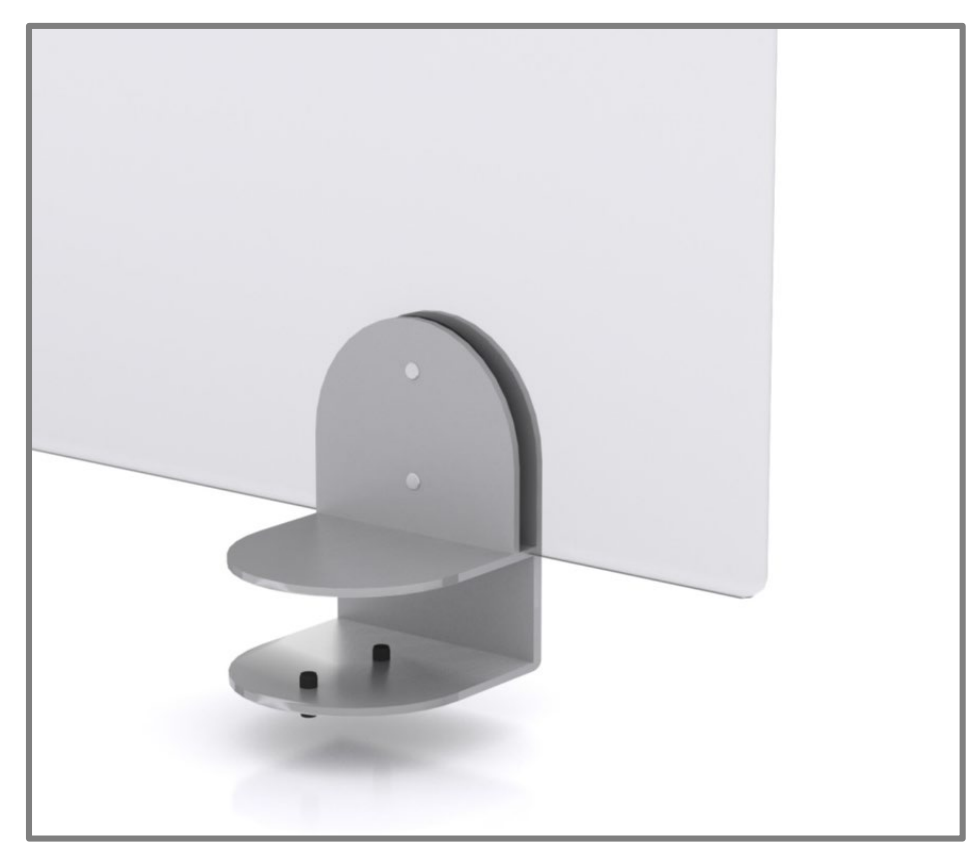
5 Carefully evenly tighten grub screws to secure glass panel, not over tightening