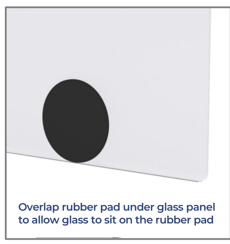
Adhere rubber pad to glass panel the same distance inset as the bracket