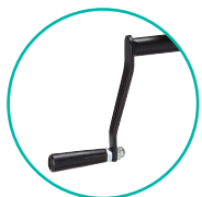
Side Crank Handle