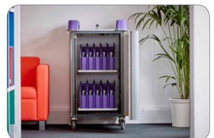
LapCabby Mini 20V