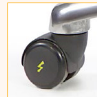
Brake loaded castors (BL)