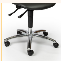
Aluminium base (CH)