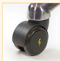
Soft tyre castors (ST)