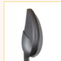
Lumbar pump (LP)