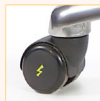
Brake loaded castors (BL)