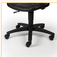
Black base (BB)