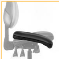
Independent seat tilt (IT)