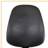
High back (HB)