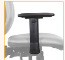
Adjustable arm (AA)