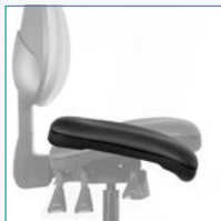
Independent seat tilt (IT)