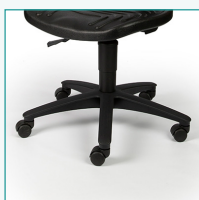
Black base (BB)