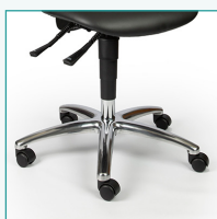
Aluminium base (CH)