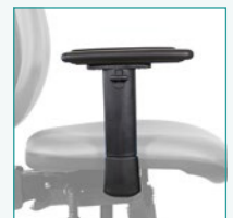
Adjustable arm (AA)