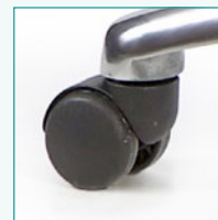
Brake loaded castors (BL)