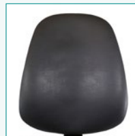
High back (HB)