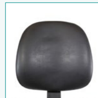
Medium back (MB)