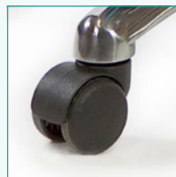
Soft tyre castors (ST)