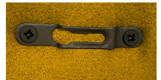
Bracket | Side Panel

NB. Brackets & Screws might can be tight for transportation reasons, They can be loosened slightly to allow the panels to slot together.